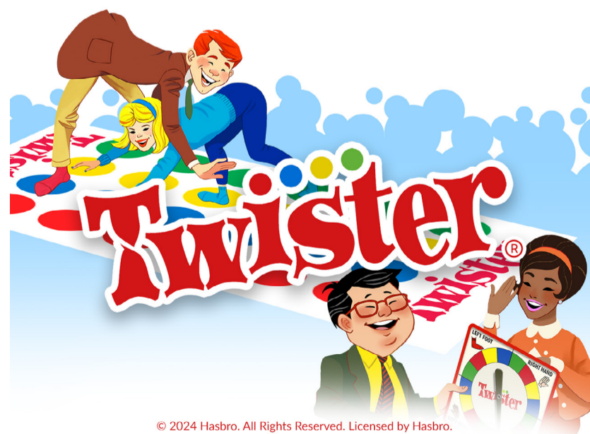
© 2024 Hasbro. All Rights Reserved. Licensed by Hasbro.